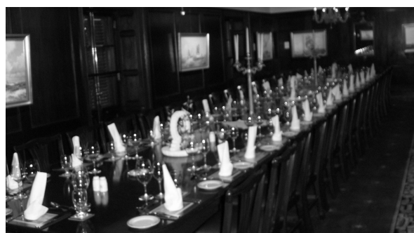
The ISCA Conference dinner table in the Commissioner's House, Royal Naval Dockyard, Bermuda